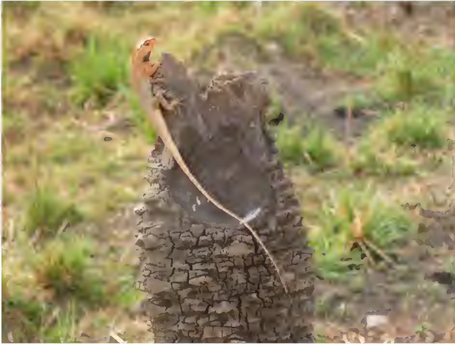
Fig. 2G. Indian Garden Lizard Calotes versicolor .